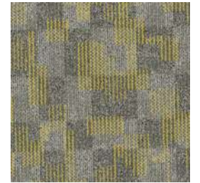
TEM22 | SNAPPY