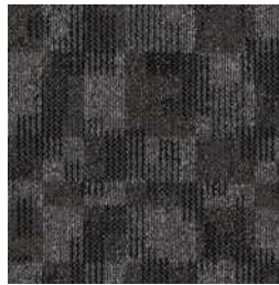
TEM58 | CADENCE