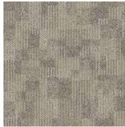
TEM12 | LIGHTEARTED