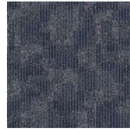
TEM47 | BLUESTREAK