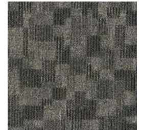
TEM55 | DOUBLE TIME