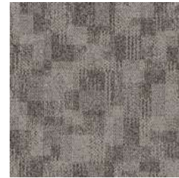
TEM15 | PULSE