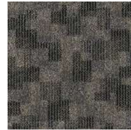
TEM18 | SWING