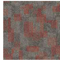
TEM84 | SCREAMIN'