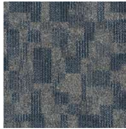
TEM44 | ANIMATED