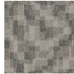
TEM52 | SPARKLING