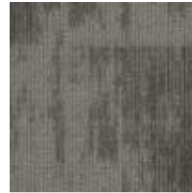
ART30 SAND QUICKSHIP