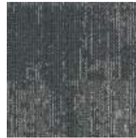
ART58 SLOE QUICKSHIP