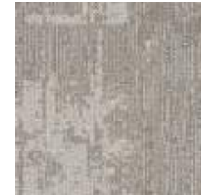
ART75 TAUPE QUICKSHIP