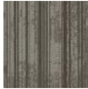
ARA75 TAUPE ACCENT QUICKSHIP