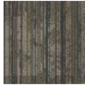
ARA35 GROUND ACCENT QUICKSHIP