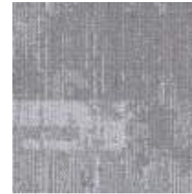
ART56 MOLESKIN QUICKSHIP