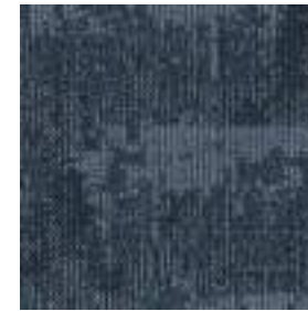
ART49 BICE QUICKSHIP