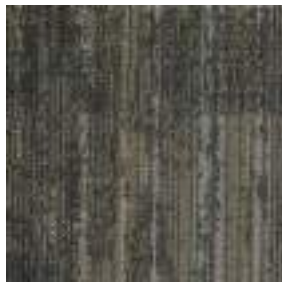
ARA58 SLOE ACCENT QUICKSHIP