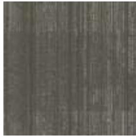
ARA56 MOLESKIN ACCENT QUICKSHIP