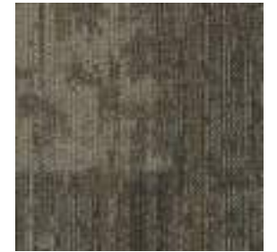
ART35 GROUND QUICKSHIP