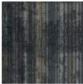
ARA49 BICE ACCENT QUICKSHIP