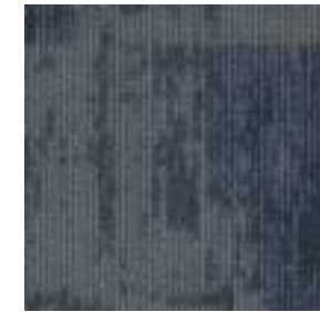
ART18 SKY QUICKSHIP