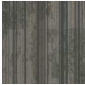
ARA30 SAND ACCENT QUICKSHIP