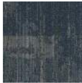
ARA18 SKY ACCENT QUICKSHIP